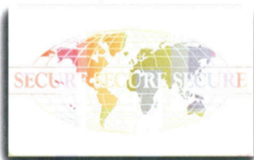
PVC-OVL - WORLD MAP SECURE