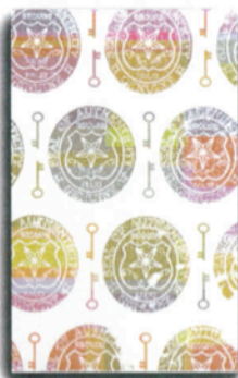
PVC-OVL - SHIELD AND KEY

Added Security: holographic image makes duplication extremely difficult • Increased Durability: add years to the image on your card with our protective laminate • Pressure Sensitive: easy to apply to any card formulation, great for prox cards! • Economical Security: added security without the cost of upgrading your printer • Custom Holograms: send us your logo or artwork, we'll do the rest ($250 die fee) • ID Guarantee: we will not reproduce your custom design for any other company • Fast Turnaround: custom orders are shipped within three weeks of proof approval, stock designs are shipped within 24 hours with availability • Short Runs: 250 unit minimum