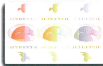
PVC-OVL - AUTHENTIC EAGLE